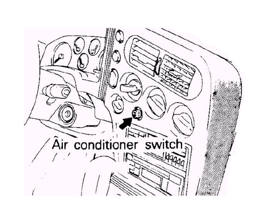
For 1G DSM dashboard disassembly refer to the 1G DSM service manual.

1G DSM ECU Connectors. Pin # 19 (GREEN/WHITE wire) is a TPS signal.